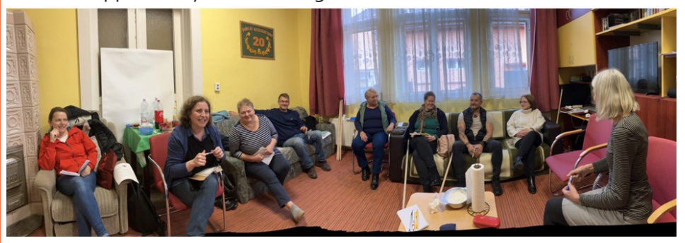
Training: Team Work

We have had two days providing training and support for staff of a children's home on the effects of trauma on children's development and how to bring healing through relationship. It was amazing, lots of good questions and discussions as to how it applied to their particular situations and children. It certainly kept us on our toes! This kind of training also brings up things in peoples own personal lives and provides an opportunity for us all to grow.