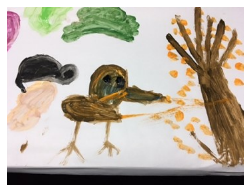
Above: Pelicans Below: Owl in a tree with bird flying by