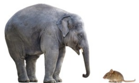
The Elephant & the Mouse