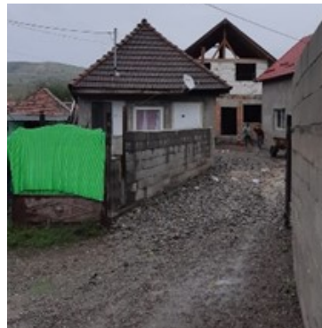
Rupi's house - nearly done